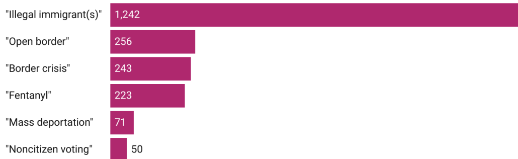
Chart: Immigration Hub • Source: Critical Mention • Created with Datawrapper

Right-wing media use of anti-immigrant buzzwords in October 2024: